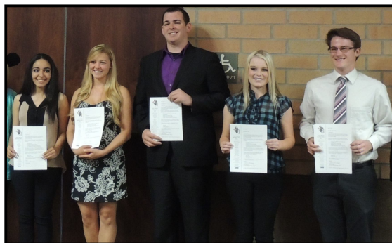
Two from San Dimas and Glendora one from La Verne

The generosity and continued support of our sponsors has allowed us to increase the amounts awarded to between $5,000 and $10,000 which has been offered the past nine years.