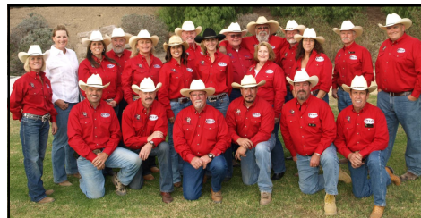
San Dimas Rodeo Board of Directors

Plus an invitation to the Annual Pardner Reception on Thursday evening with awards, a preview of the coming weekend's entertainment, music and celebrities.